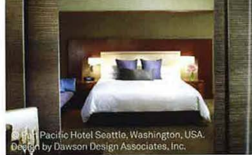
© Fair Pacific Hotel Seattle, Washington, USA. Design by Dawson Design Associates, Inc.