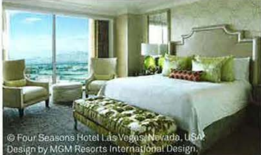
© Four Seasons Hotel Las Vegas, Nevada, USA. Design by MGM Resorts International Design.