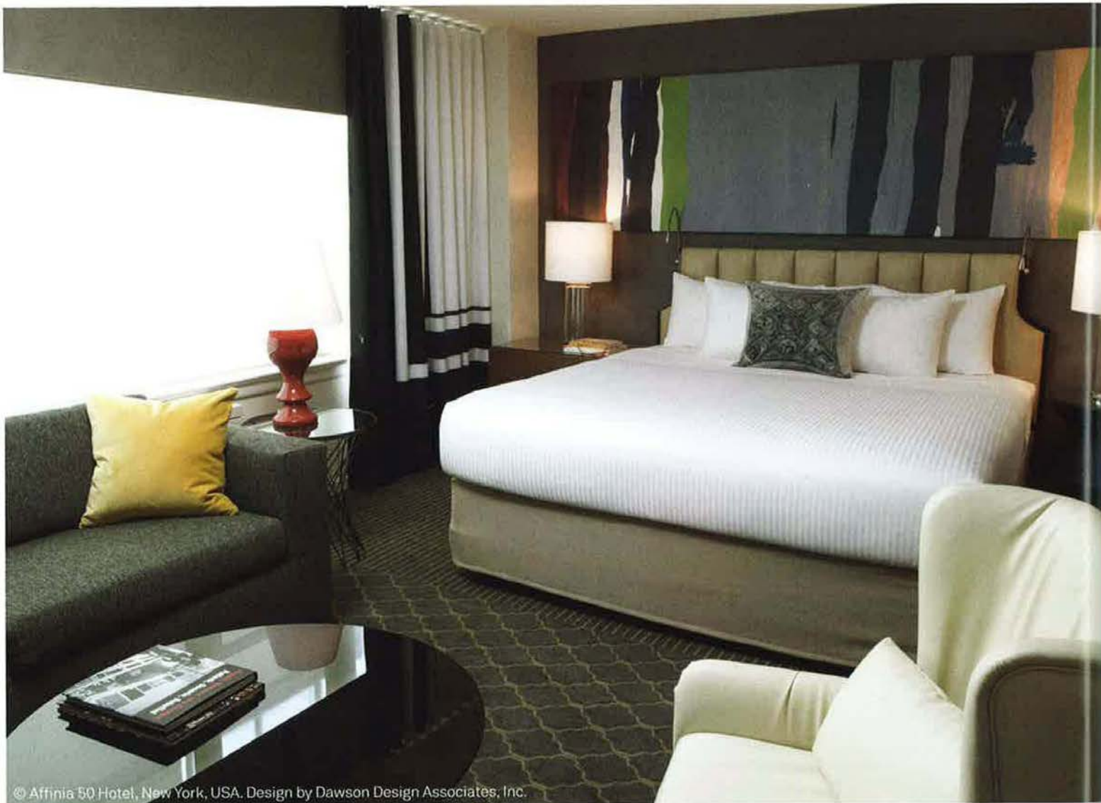
© Affinia 50 Hotel, New York, USA. Design by Dawson Design Associates, Inc.

Saniharto is one of the world's leading manufacturing companies, specializing in custom state-of-the-art residential and contract furniture for the luxury hotel and apartment market.